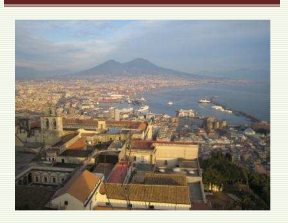
World Heritage Site of Naples with Vesuvius